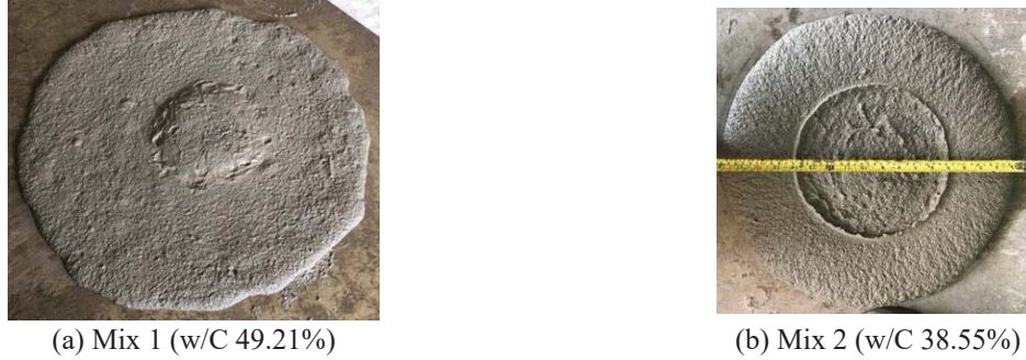
FIGURE 2. Flowability of fresh foam concrete

and foam, were able to bind sand and fibers, thereby enabling the fresh condition the foam concrete to flow with its own weight to all directions, without segregation between the paste and sand or fiber, indicating no visible blended. Therefore, these results indicate that the stable foam can blend with the paste cement resulting fresh foam concrete with adequate flowability. The volume weight of mix 1 was 1375 kg/m 3 and the volume weight of mix 2 was 1460 kg/m 3 , respectively.