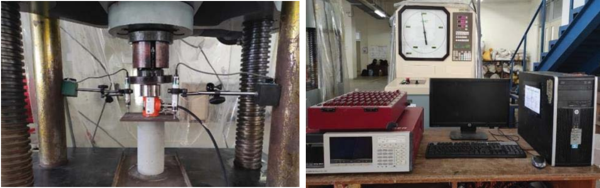
FIGURE 1. Compressive Strength Test and Computer Set

Figure 1 indicates the usage of devices to test the compressive strength of cylindrical specimen. Compressive strength was obtained by placing a load cell to capture compressive load in the Universal Testing and Machine UTM, where the compressive stress is the monotonic compressive load divided by the area of the specimen.